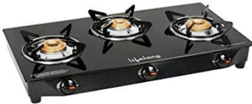
Fig. Diagram showing Gas Stove Burner