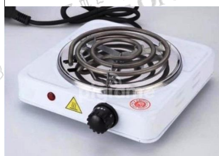
Fig. Electric Stove Hot Plate