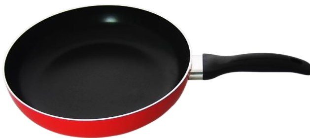
Fig. A Frying Pan

Q6. What are the disadvantages of cooking?