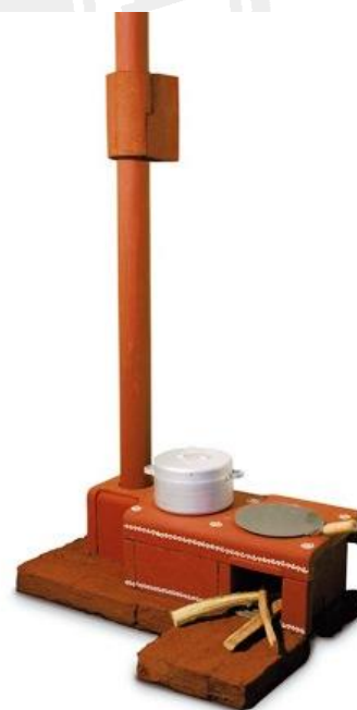
Fig. Diagrammatic Representations of Chula (Chulha) having L-shaped & 3-holes

It is L-shaped and has three holes. Each hole is of 8 inches of diameter. The fire is lighted at one end and the smoke and heat is drawn through the chimney at the other end. If any of the three holes is not in use, it should be covered to prevent the smoke escaping into the room.