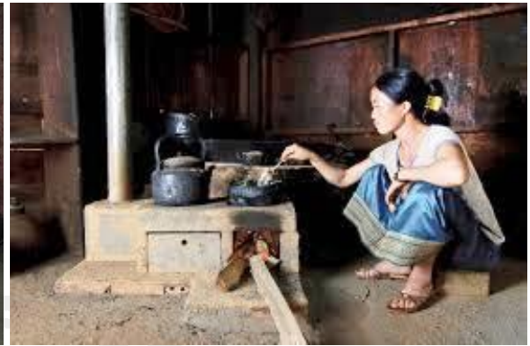
Fig. Diagrams showing women using Smokeless Chulhas