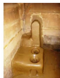
Fig. Diagrams showing Smokeless Chulas