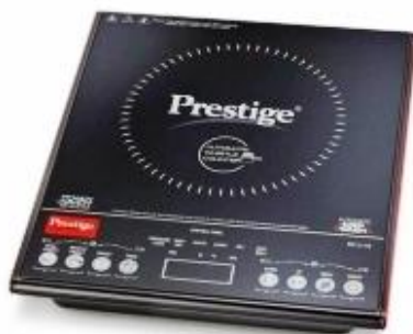
Fig. Electric Induction Stove